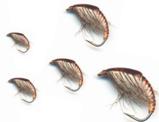
The Ammonite Nymph # 8 - 16